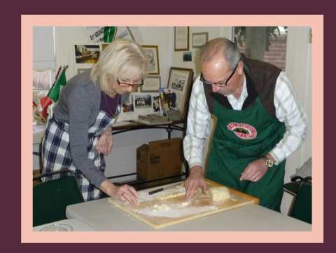
Italian Cooking Classes