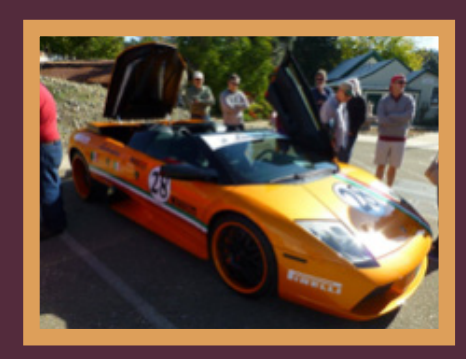
Annual "Italy on Wheels" Car Event